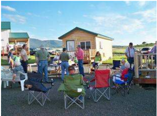
Thursday Night