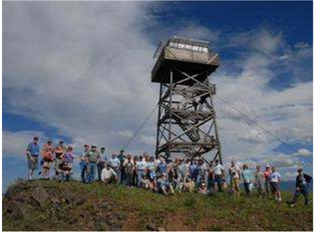
FFLA at Grave Point Lookout