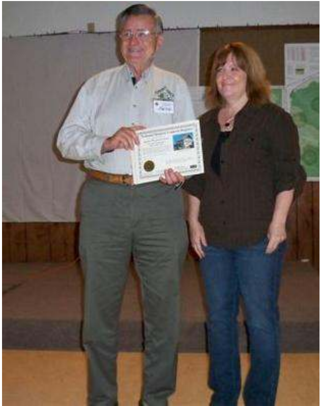
Square Mountain NHLR