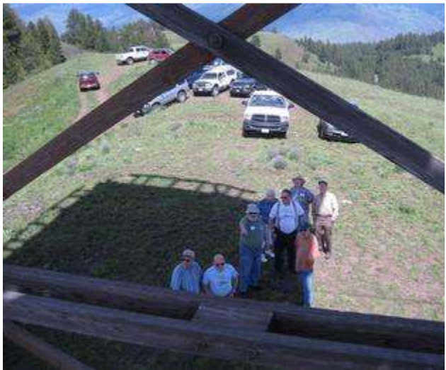
The line waiting their turns at Grave Point