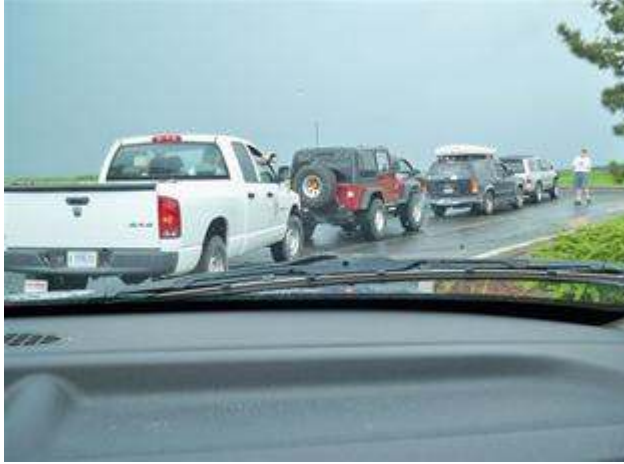
Convoy gathers for Corral Hill