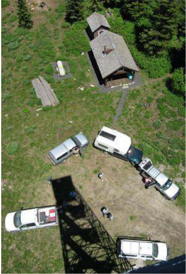
Walde LO tour