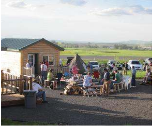
BBQ at Bears Den RV Park