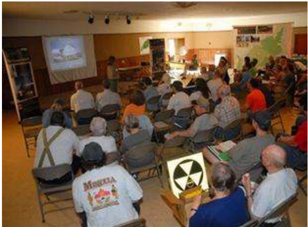
FFLA Conference at Elks Lodge