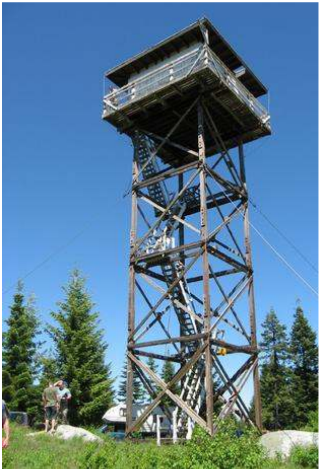
Austin Ridge LO tour