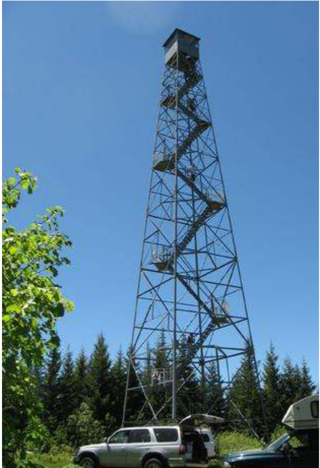
Walde LO tour