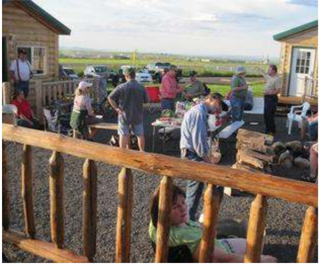
BBQ at Bears Den RV Park