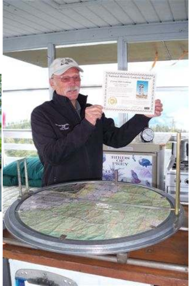
Corral Hill NHLR