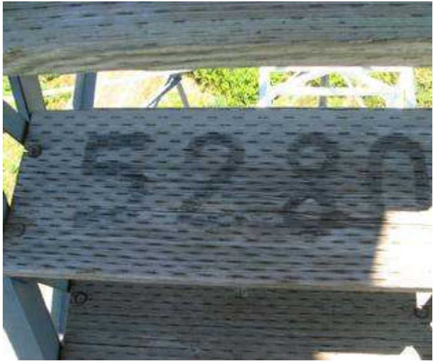
Mile High step at Walde LO