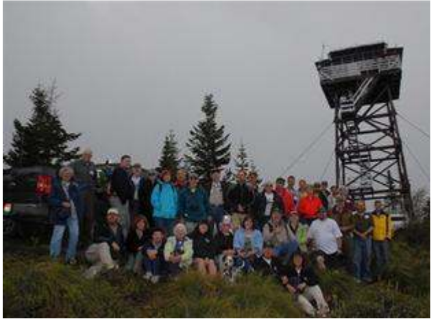
FFLA at Corral Hill Lookout