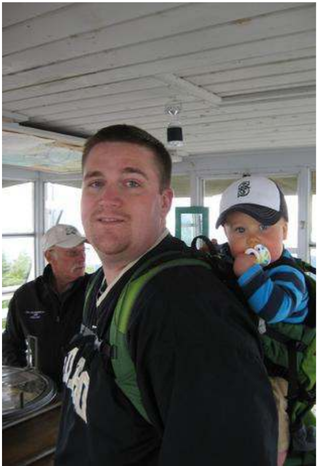
Corral Hill tour - the youngest touree