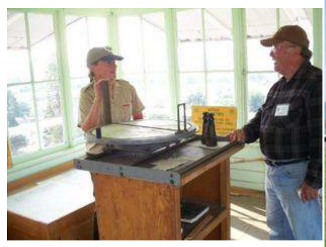
Inside Graves Mountain LO