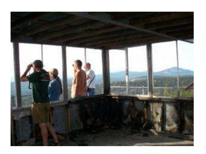
View from Cornell Butte LO