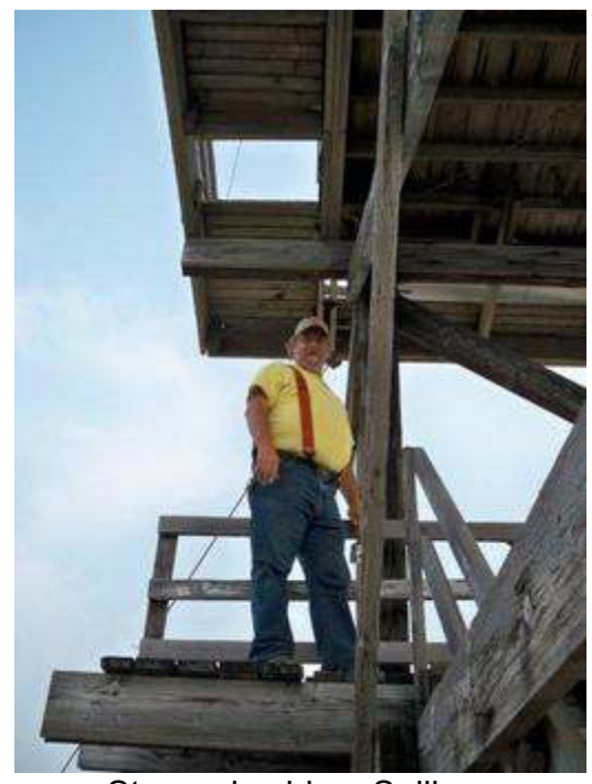
Stopped cold on Sullivan