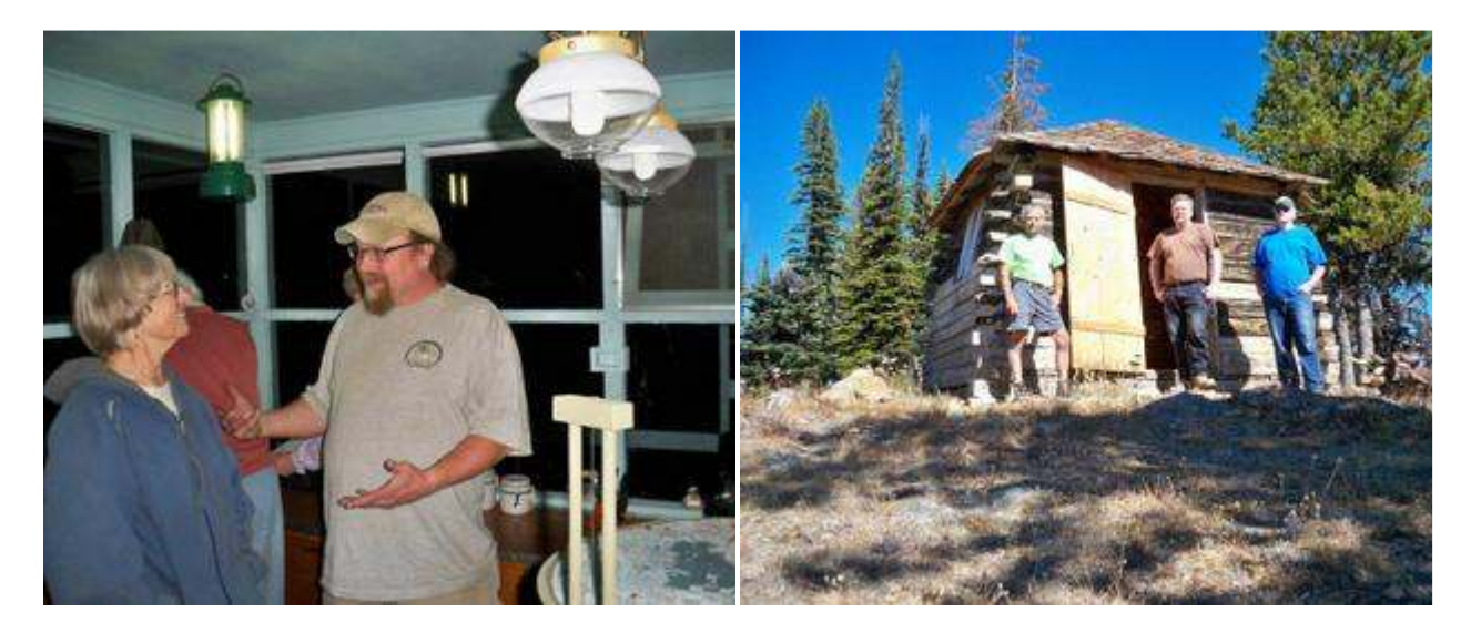
After dark in Monumental