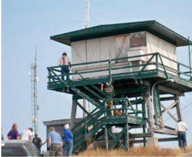
For his many years of service