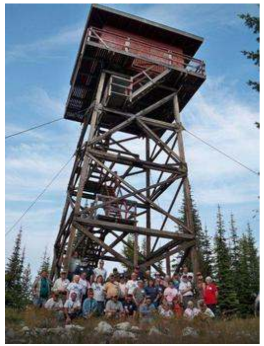
Group at Timber Mountain LO