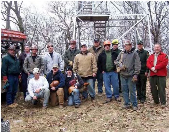
The Ironworkers of Local 10, NYS-DEC Forest Rangers and Chapter members on the April 5 th work day.

In addition to the hand railings along the fire tower stairway wire safety meshing was also installed around each landing platform on the tower.