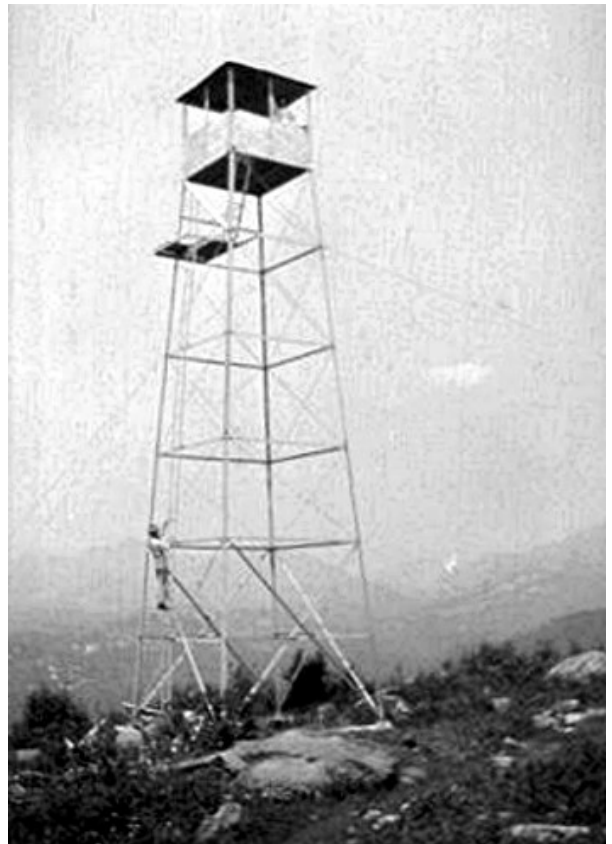
The Aermotor model LL-25 tower on Makomis Mtn in 1916

In 1916 the state introduced the standard steel fire tower with the purchase of ten Aermotor model LL-25 fire towers, nine of which were placed into service in 1916.