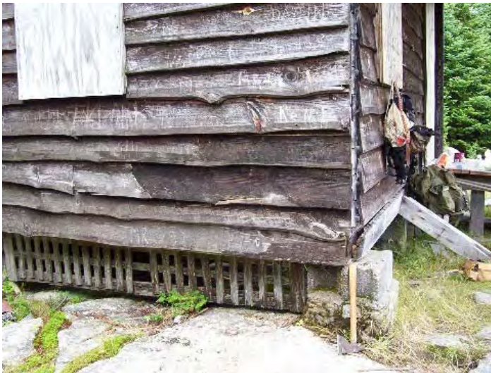
Repair of the damage