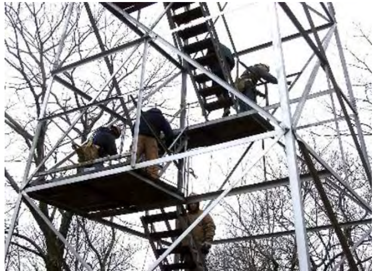
Members of Local 10 working on the fire tower.

The engineer wanted new bolts and nuts installed where the structural “X” braces are bolted onto the legs of the tower. Then he wanted the hand rails on the top three stairway landings raised to an elevation of 42”, but it was decided to raise the handrails on all the landings and stairways to the same height and to install a mid-rail for an additional safety measure.