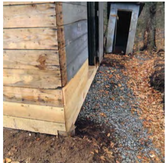
New cabin footings and drainage.