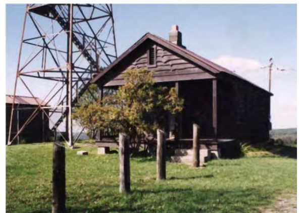
The Berry Hill fire tower and Observer's cabin in 2002.