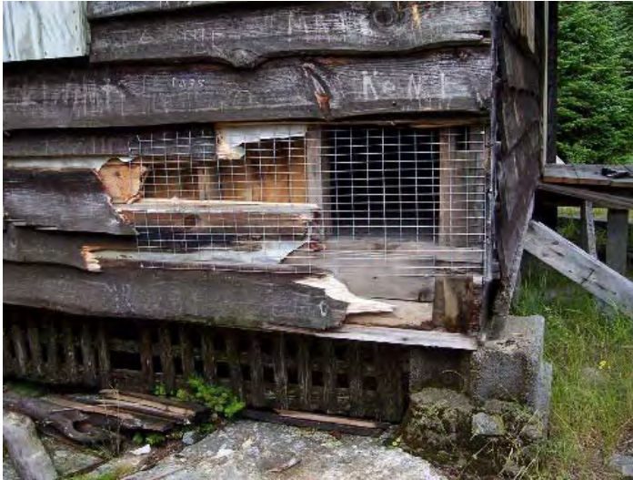
Damage to the cabin exterior.

Bob and Scott Eckler were able to secure funds from the NYS-DEC to temporarily repair the damage done to the cabin and a new roof shall be installed on the cabin in 2009. As for the red tape talks will be conducted with DEC to eliminate this problem for 2009.