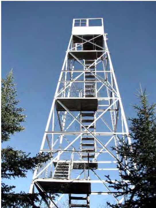
The Mt. Adams fire tower with a fresh coat of paint.