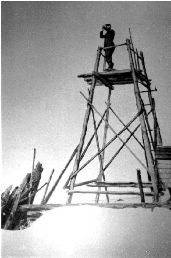
The Cathead Mtn wooden fire tower in 1910

2009 marks the Centennial of the fire towers here in New York. In 1909 the state began operating forest fire lookout stations with crudely built towers made from timbers found on the mountaintops.