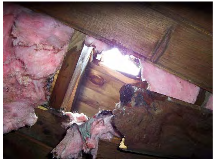
Interior damage to the cabin when the pole was rammed through the roof.