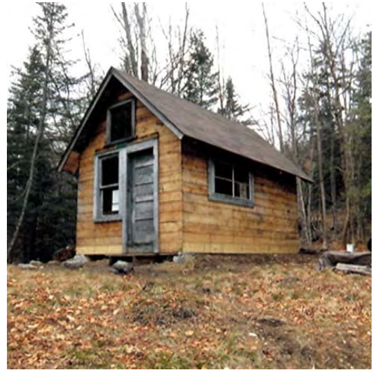
The cabin under restoration in 2008.