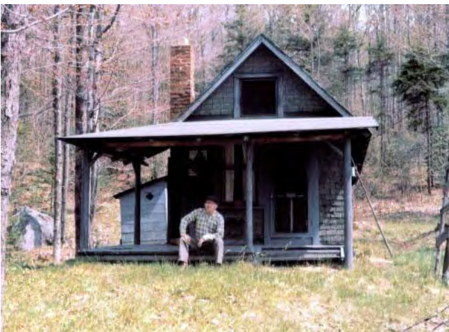
The Mt. Adams cabin in 1964.