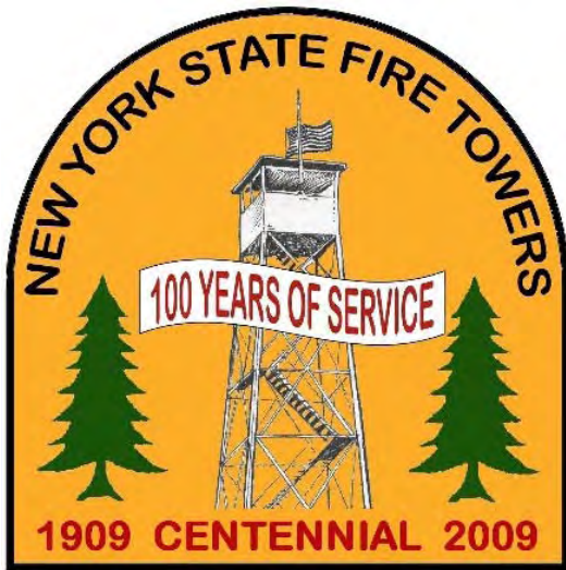
The Centennial commemorative patch.

Therefore the fire towers have been serving the people of New York for 100 years and to commemorate this Centennial the FFLA will be launching several projects to mark this milestone beginning with the sale of a commemorative patch.