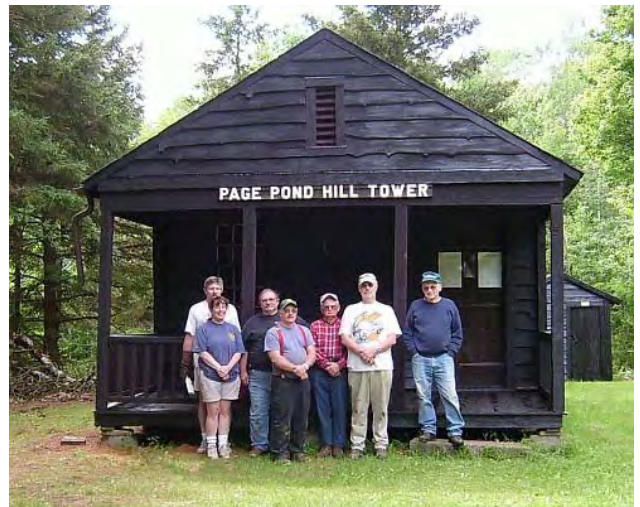
The FFLA-NY volunteers in front of the Page Pond Hill cabin.