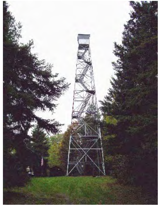
The Page Pond Hill fire tower International Derrick model 1933 - 76' 9" tall.