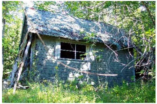
The rundown cabin in 2004.

Restoration work to the cabin will continue in 2009 as well to the fire tower. Half of the roof blew off of the fire tower in 2006 and new roof panels have been made and will be installed on the fire tower by the NYS-DEC.