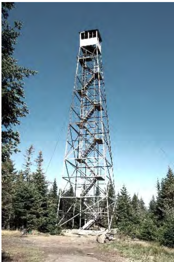
The Aermotor model LL-25 fire tower on Wakely Mtn in 2005.

The cabin at Wakely does not qualify for listing on the National register as it was built in 1967 and does not fall under the 50 year rule.